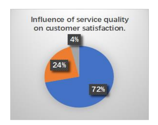
Figure 1. Influence of Service Quality on Customer Satisfaction

Through the study of the remaining valid questionnaire, it was found out that 72% customers thought the quality of service has an impact on their satisfaction, high quality of service will make them more satisfied. On the contrary, the lower quality of service will make them feel dissatisfied, 23%' customers believe that the quality of service has no effect on their satisfaction. 4% customers think that high quality of service will make them dissatisfied.